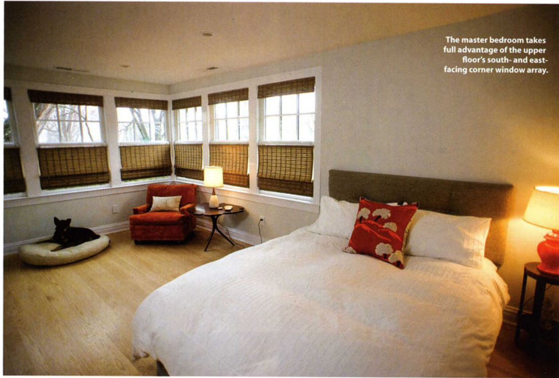
The master bedroom takes full advantage of the upper floor's south- and east-facing corner window array.