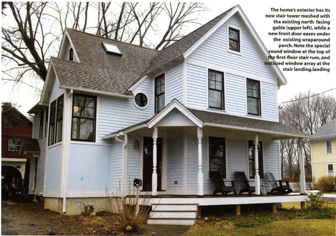
The home's exterior has its new stair tower meshed with the existing north facing gable (upper left), while a new front door eases under the existing wraparound porch. Note the special round window at the top of the first-floor stair run, and oversized window array at the stair landing.

the buck. Thus when three walls gave way to three beams, the home's ground-level interior became remarkably open, informal and bathed in the light of its oversized south-facing windows.